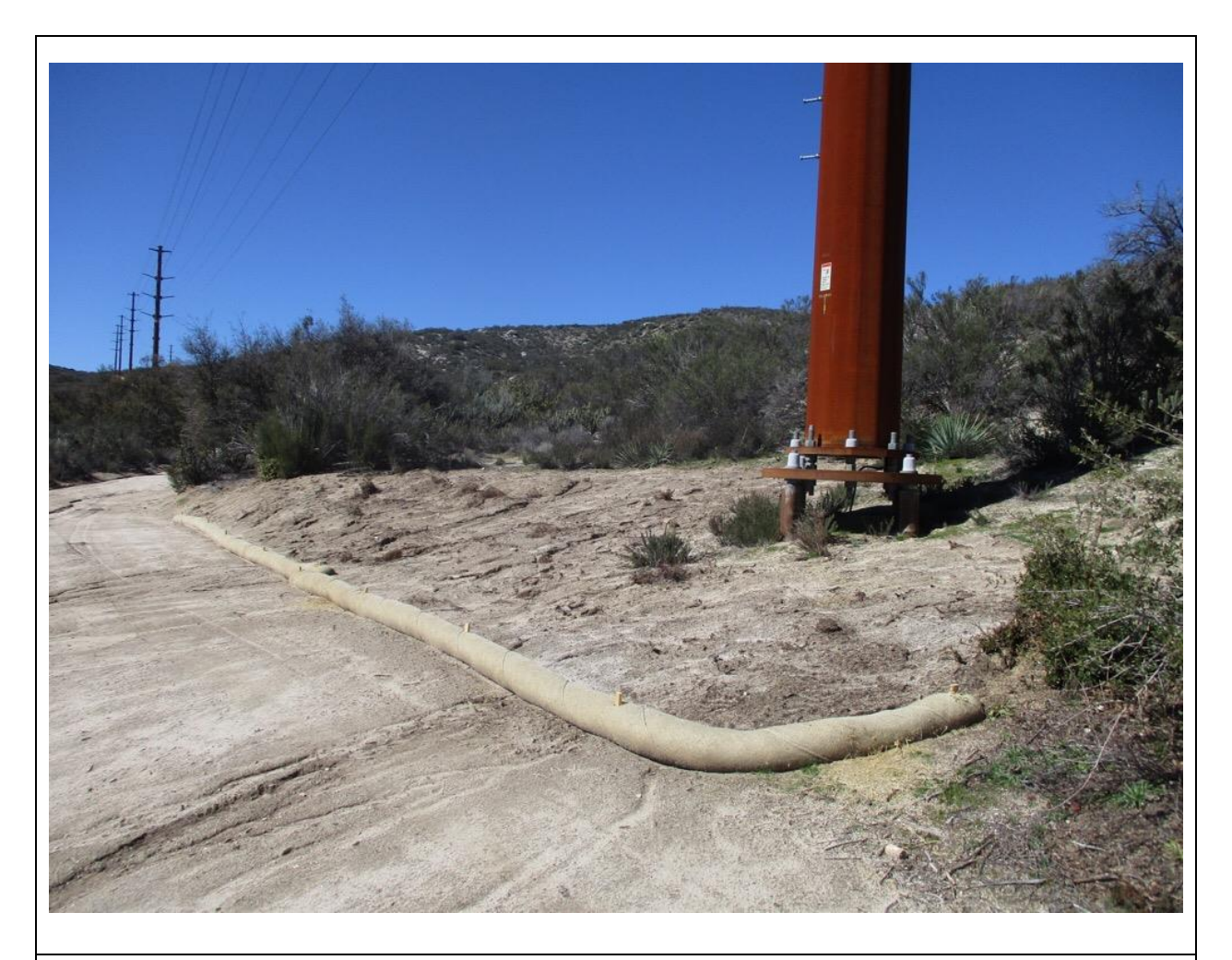
Photo 4: CPUC ECMs observed redistributed topsoil and a newly installed fiber roll for erosion and sediment control at the completed worksite at Z44201 (TL 629E).