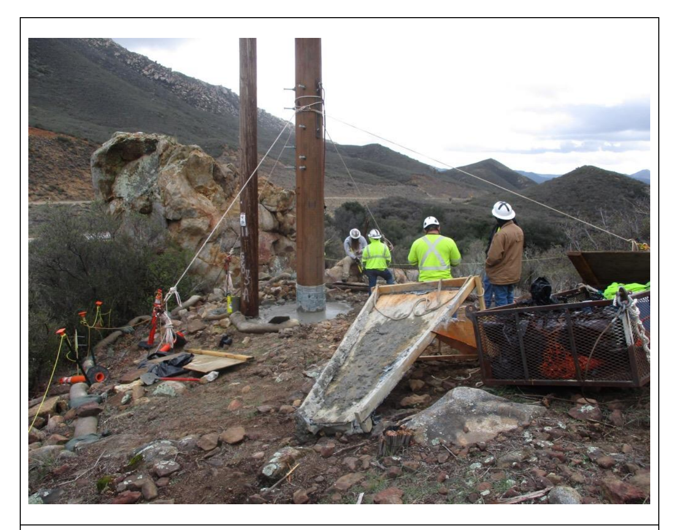
Photo 3: BMPs were implemented during direct bury foundation pouring at Z40425 (TL 629C) including fiber rolls and concrete waste containment to prevent excess concrete and waste from being discharged onto the ground in accordance with APM HYD-01.