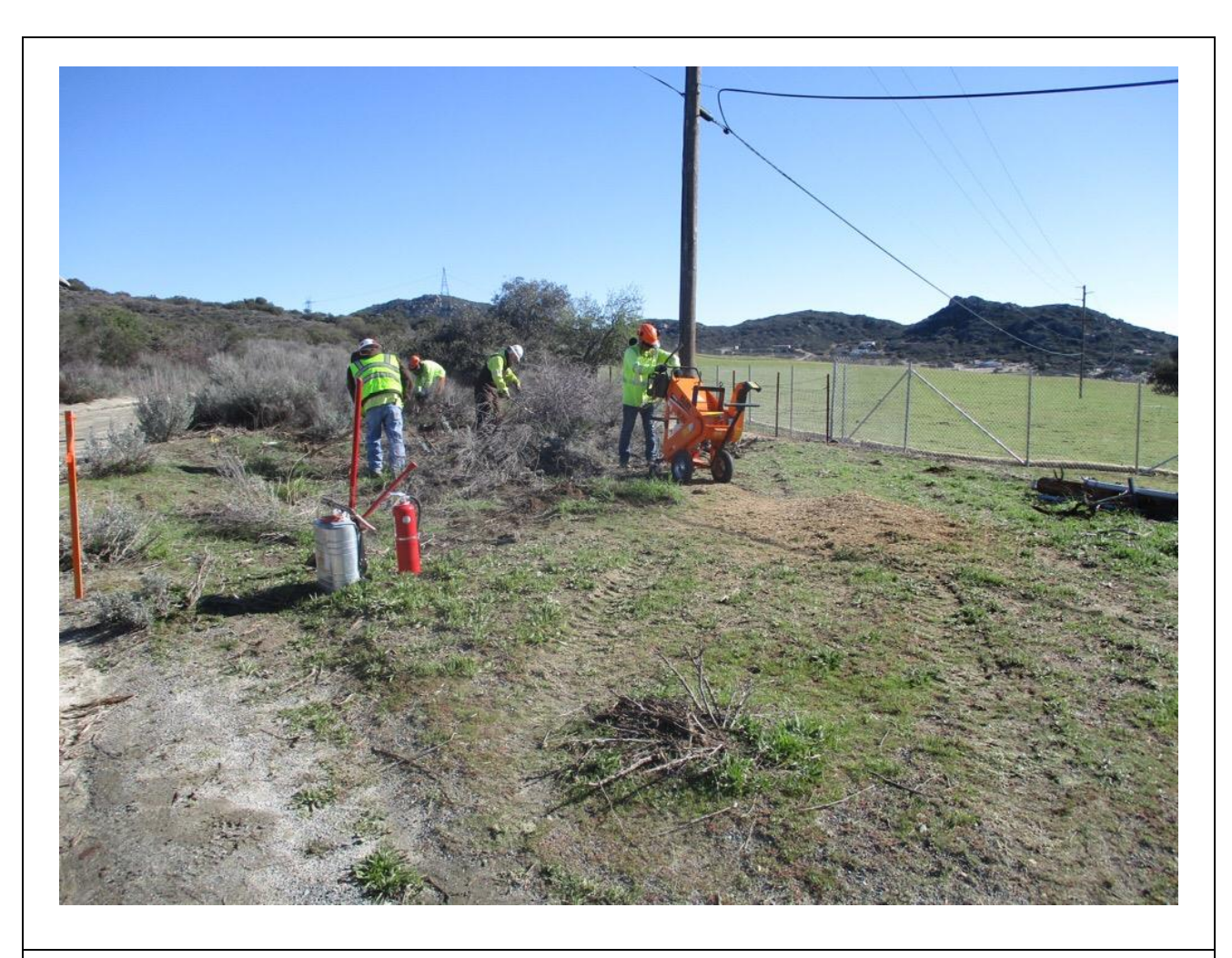
Photo 6: A complete set of fire tools was placed within 50 feet of the observed vegetation clearing and chipping activities at the southern entrance/exit to the Bartlett Staging Yard, in accordance with the CFPPP fire prevention matrix. A Biological Monitor was also observed monitoring the activities in accordance with MM BIO-3.