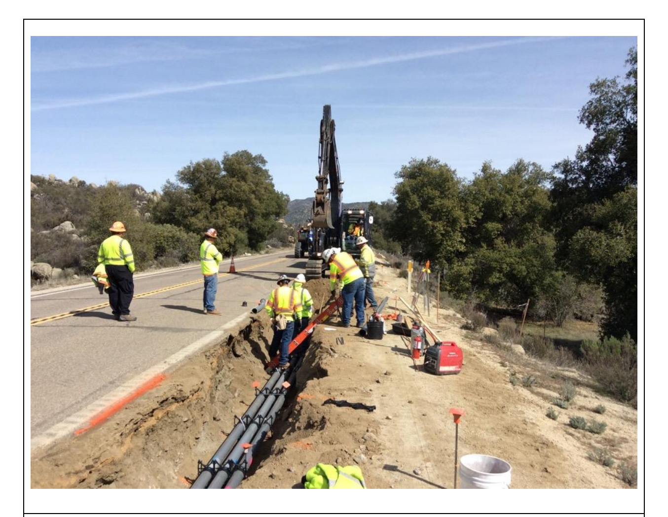
Photo 5: Construction crews were observed trenching and installing conduit along Buckman Springs Road (C 449).