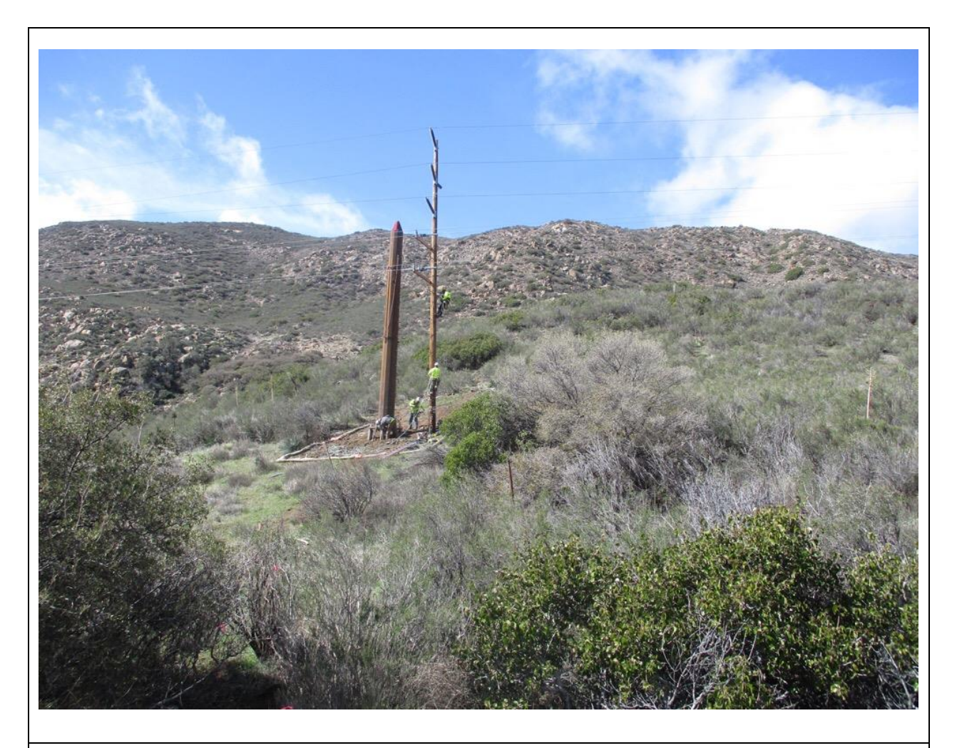
Photo 2: A construction crew was observed installing a pole base recently delivered via helicopter external load and preparing to receive the pole top at Z40511 (TL 629C).